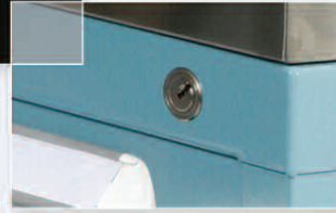
Unique Locking Systems