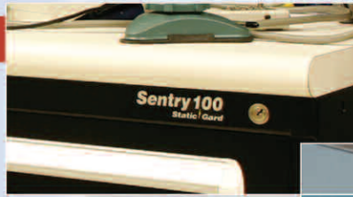
StaticGuard™ Protective Surfaces