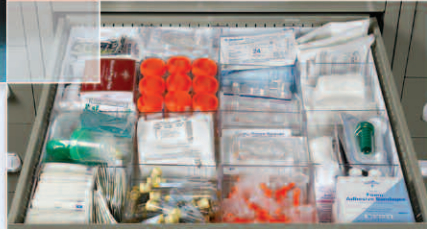
Custom Drawer Configurations